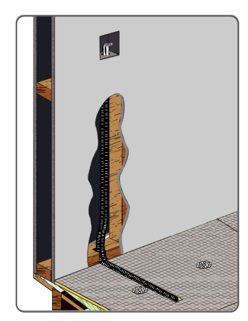
Floor temperature sensor should be installed in a conduit, within a clear area of the floor, and away from any other temperature influences.