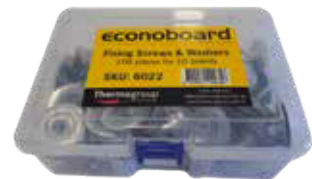
6022 Fixing Washers and Screws