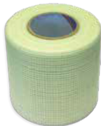
6015 Reinforcing Tape