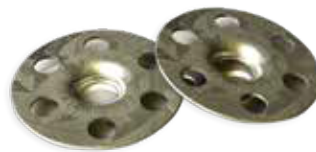
6016 Zinc Fixing Washers